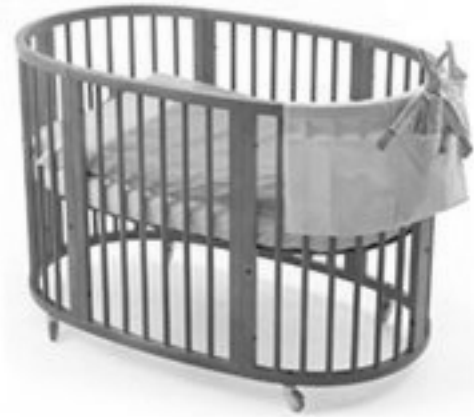
The Stokke Sleepi, already expanded once

Back to the snap ‘n’ go. Unfortunately, that Graco combo only lasts for the first few months, until the baby weighs twenty pounds or so. Soon enough it becomes time to shop for a “real” stroller.