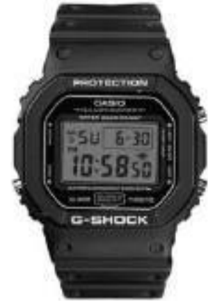
The Casio G-Shock Classic

There are other G-Shock models, but they tend to be awkward attempts at fashion. Casio's strong suit is practicality, not style, and the G-Shock Classic is Casio's most practical watch. So what if it's not fashionable? I'd rather be able to set a timer easily than to look cool while flailing about on some silly fashionista watch.