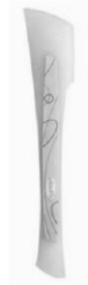
The Chef’n Switchit dual-ended long spatula is a keeper.

P.S. My 2007 kitchen-device recommendation, the Vitamix blender, is still a good pick. You can find the 2007 Uncle Mark guide at unclemark.org/unclemark2007.pdf .