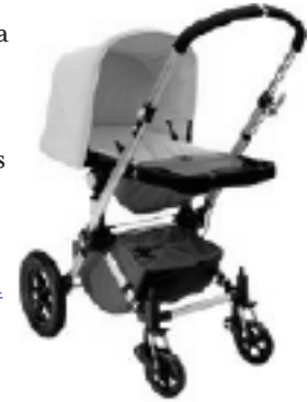
The Bugaboo Cameleon

If you want a good "push" and have some extra cash, the Bugaboo Cameleon is the top of the line. It's the Cadillac of strollers: dual independent shock absorbers on the front wheels, rubber tires in the back, endlessly configurable, the "Bug" is a great vehicle – but it's expensive (over 900 bucks) and doesn't fold easily. Bugaboo also makes Frog and Bee models that are smaller and slightly less expensive than the Cameleon.