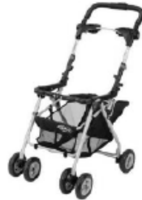
The Graco Snugrider “snap ‘n’ go.”