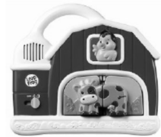
The LeapFrog Fridge Farm

Once the little one is several months old, an excellent toy is the LeapFrog Fridge Farm , which is a set of animal-shaped magnets that click onto a base that plays sound and music. The design is outstanding (a quality I've found in most LeapFrog products I've tried), but the real brilliance of the product is contextual. The Fridge Farm fits nicely onto the front of the refrigerator, thereby giving the kid a fun distraction when they're in the kitchen. Parents will grasp the importance of this benefit: the child can be occupied by a safe toy (rather than cabinets or sharp implements) that sits on a vertical surface, rather than in the middle of the floor. Our own playtester has been delighted by the FridgeFarm for several months now. Highly recommended.