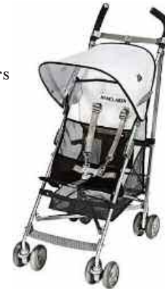
The Maclaren Volo

This isn't an exhaustive list of strollers, of course: there are many brands to choose from, some made for specific uses (for twins, jogger parents, etc.), and it's a dynamic industry with frequent new products. It's easy to get overwhelmed by the choices; this is why, for most parents, I would recommend the Volo.